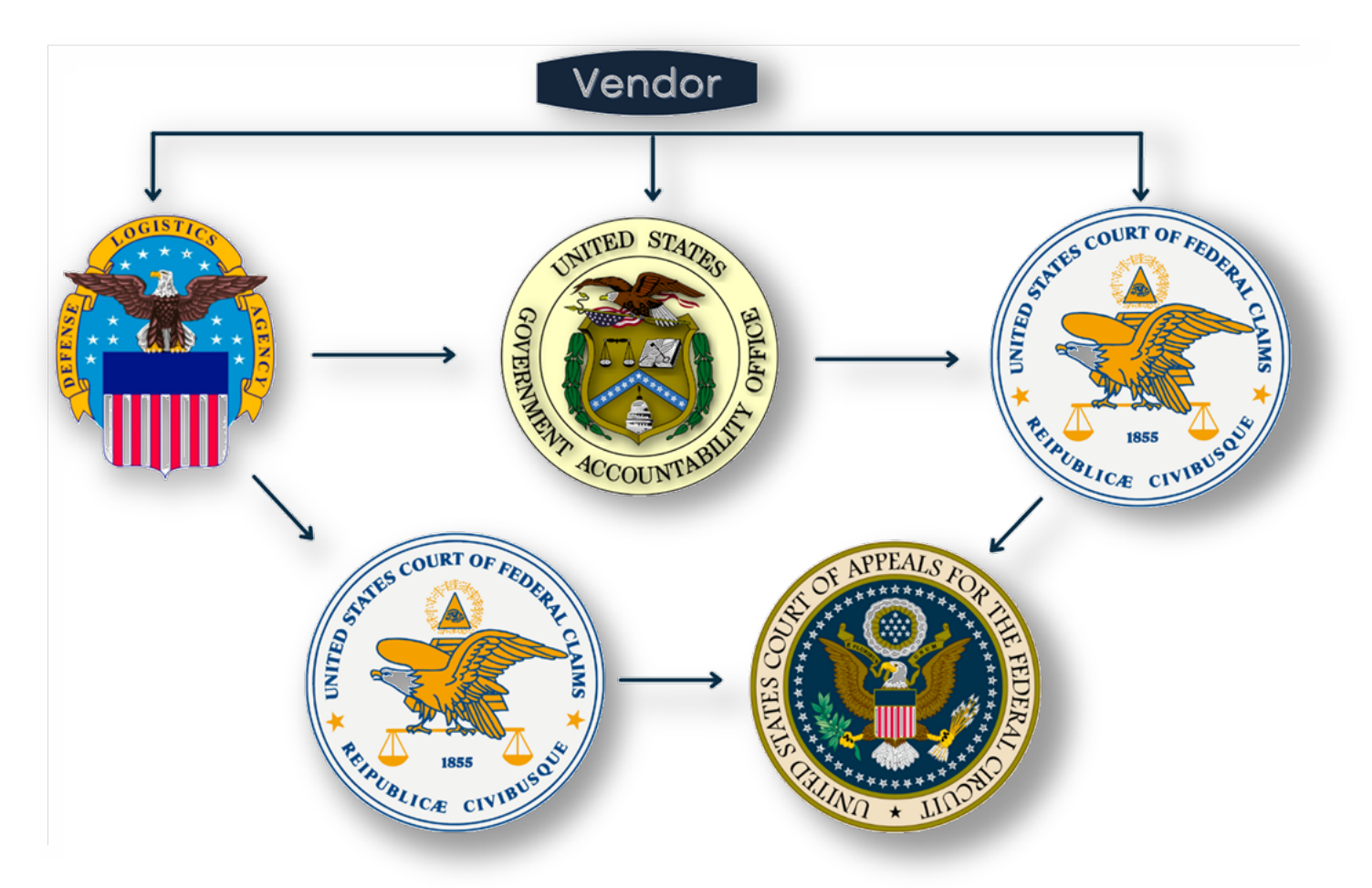
Figure 1. Options where a vendor may protest an agency procurement action.<sup>25</sup>

roughly sixty years before<sup>21</sup> Congress first explicitly granted any forum the statutory authority to do so.<sup>22</sup> The current system is supposed to resolve protests quickly and fairly without disrupting the procurement process.<sup>23</sup> Currently there are three jurisdictions where a protest against a procurement action may be filed: (1) the contracting agency, (2) GAO, (3) the United States Court of Federal Claims (COFC).<sup>24</sup>